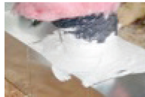
Apply mastic directly on the duct