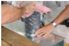
Pull back outside sleeve and duct insulation to expose flexible duct