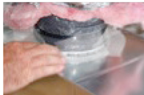
Install tie-strap and apply fiberglass mesh tape